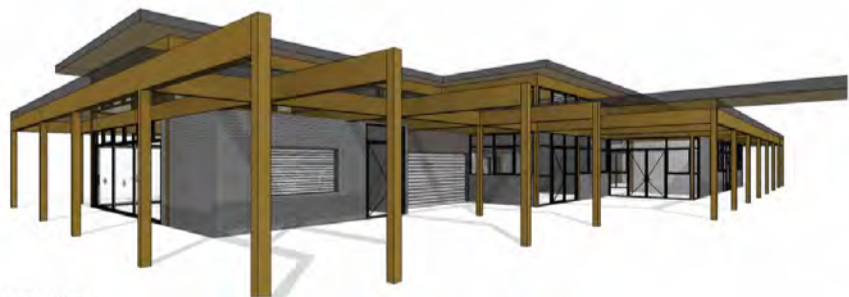
2 | 3D View COVER

The next proposed $6.4 million stage of our building program has been designed and will begin construction in Term 2 2025. This next complex will house our VET Hospitality centre and canteen space, as well as general purpose classrooms.